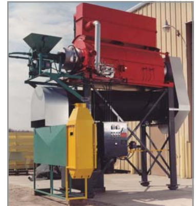
Thermal Sand Reclamation Systems